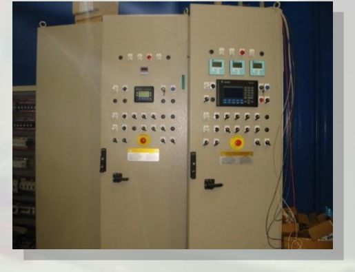
by proper on line instruments, relevant management software dgestione.

Recirculation and sludge removal systems including pumps and lamella or cone shaped clarification unit